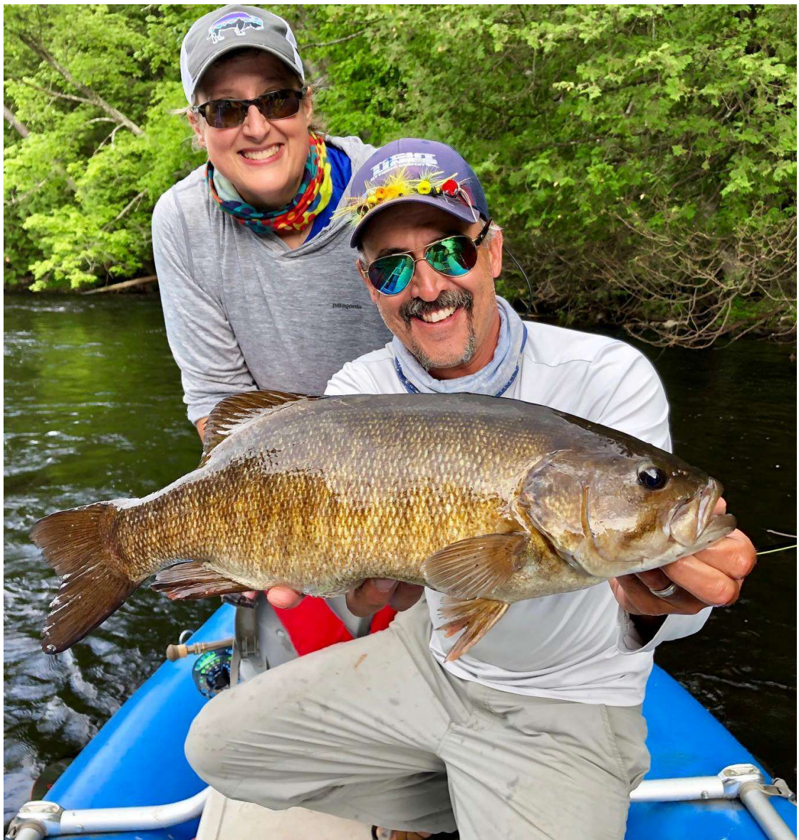
Trophy Smallmouth fishing with the crew at Tight Lines Fly Fishing Co.

The guides and shop are immensely proud of our vast knowledge of the river and the fish. Check out the bestselling Smallmouth book the shop co-authored. The book covers flies, tactics, and techniques we use every day to catch river Smallmouth Bass.